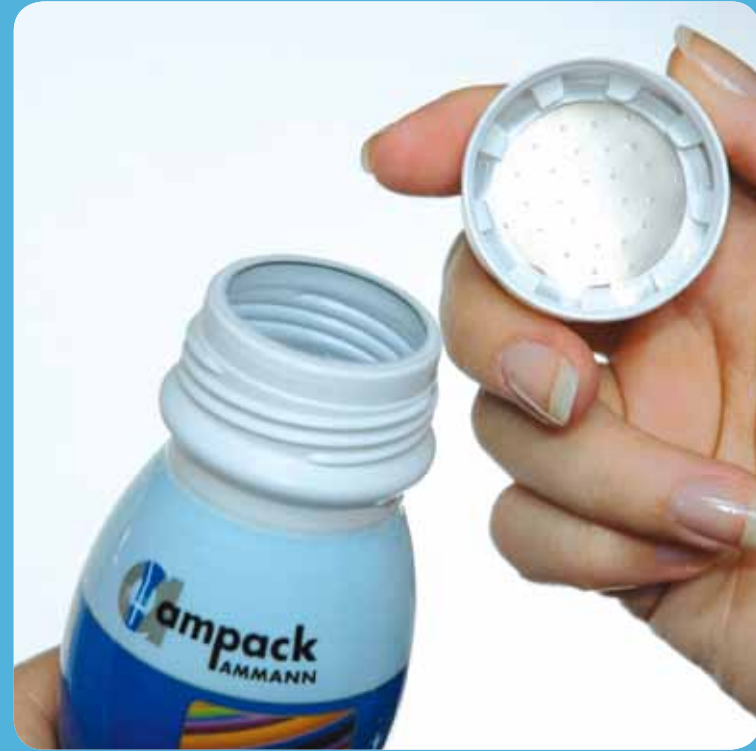
For HDPE & PP bottle (left) and PET bottle (below)

This concept combines the highest aseptic and sensorical safety of the sealing with aluminium lid with the convenience of easy-opening for the consumer.